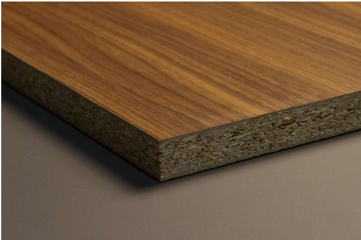
Figure 1 - Visual representation of the product

This product is designed for use in the manufacture of interior furniture, fittings and non-load bearing construction products. The product range includes specific items with improved resistance to humidity or fire. It is not intended for exterior use.